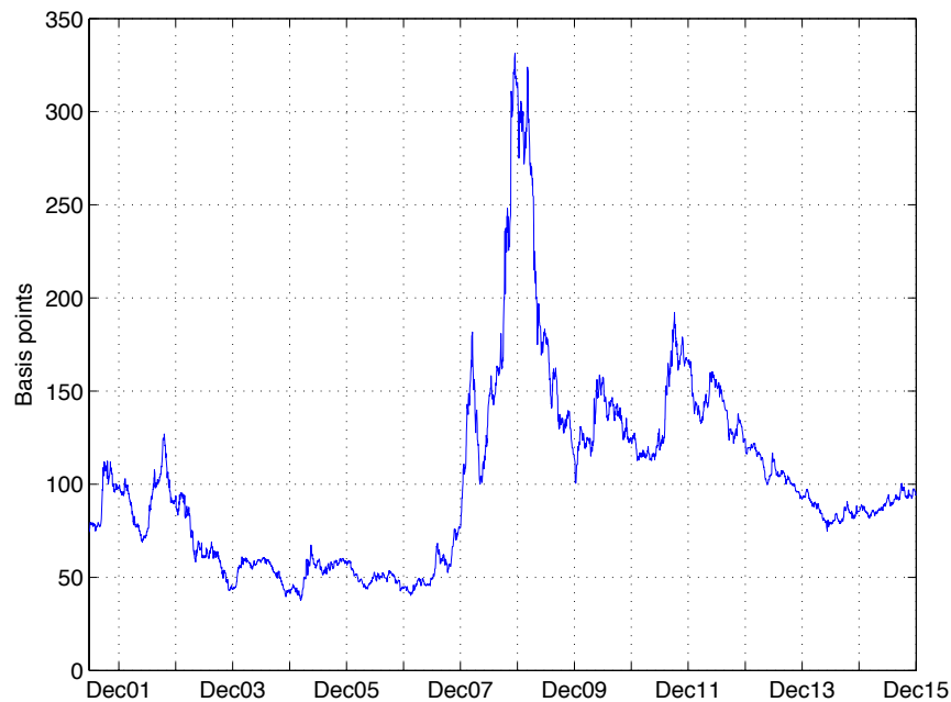
Figure 1: Median CDS spreads The figure shows the daily times series of median 5-year CDS spreads. The data include 925 firms and cover the period from 2001 to 2015. Only days for which CDS quotes are available for 30 or more firms are shown.